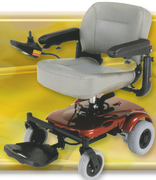
* Actual product may not be exactly as pictured