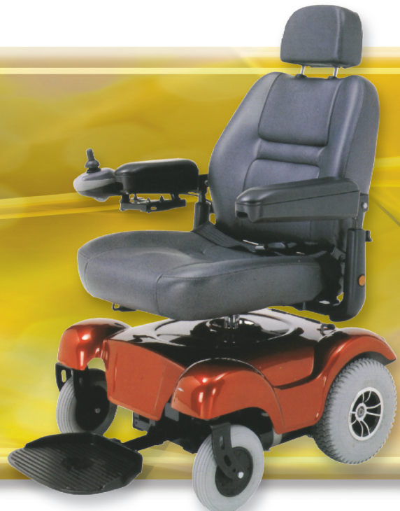
* Actual product may not be exactly as pictured